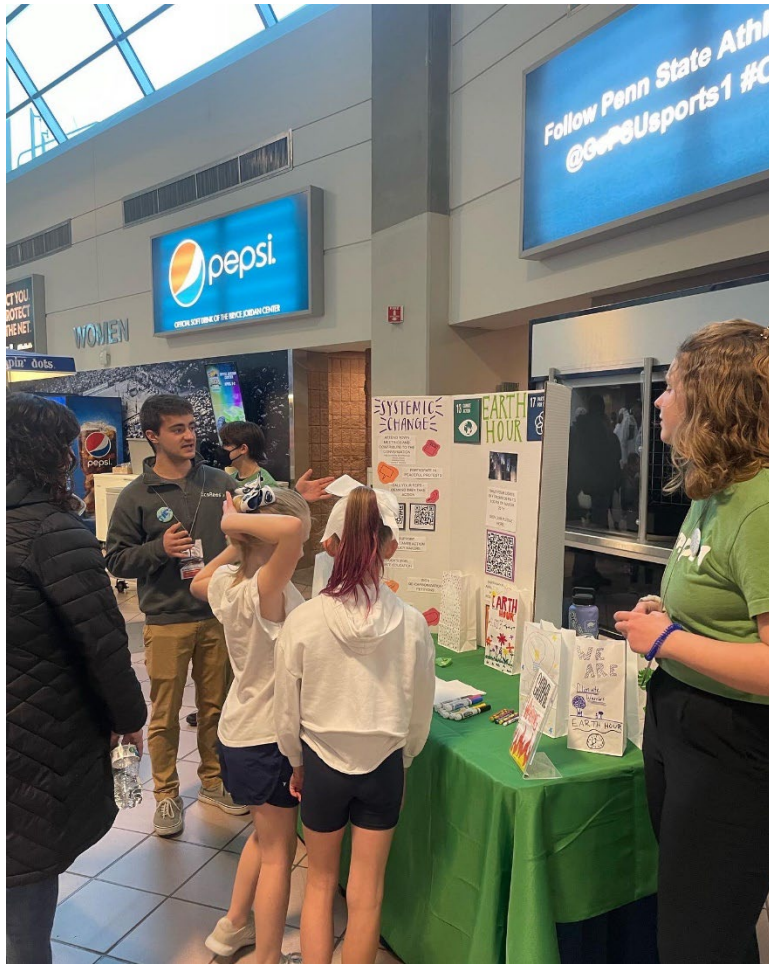
Caption: EcoRep concourse tabling volunteers educating gameday attendees about Earth Hour and energy conservation at Penn State.