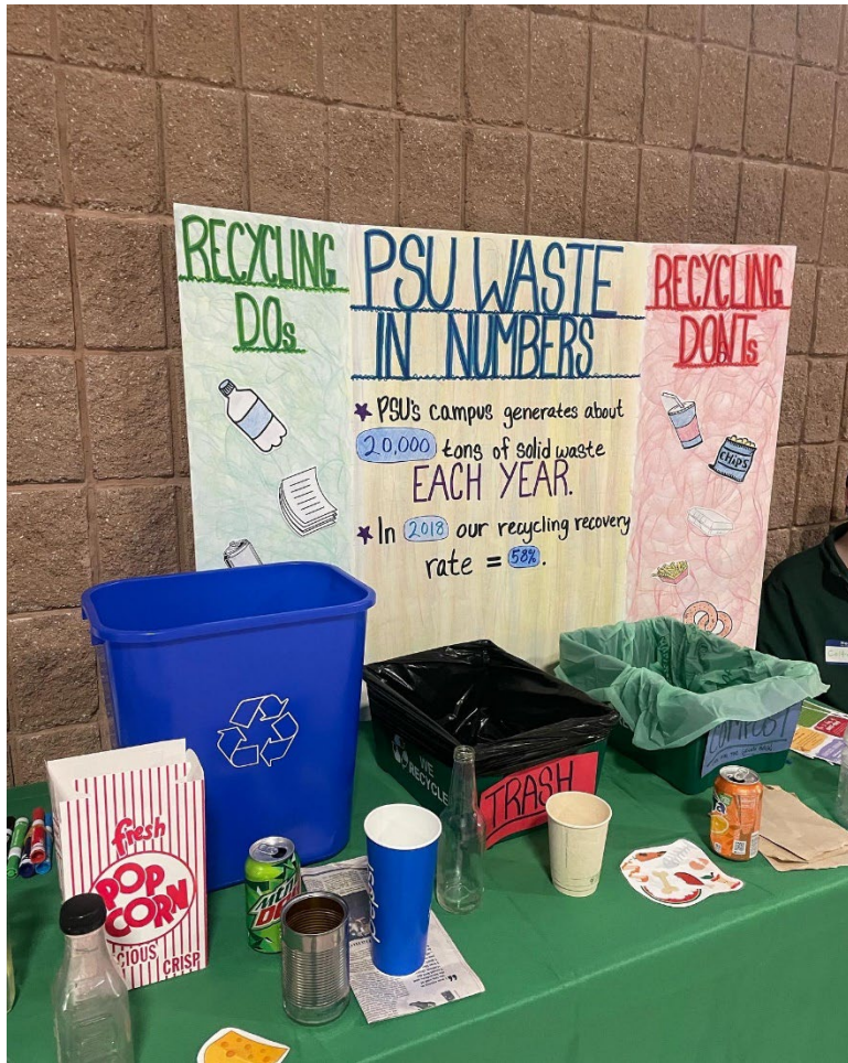
Caption: Recycling information table and recycling roadshow activity set up for concourse tabling.