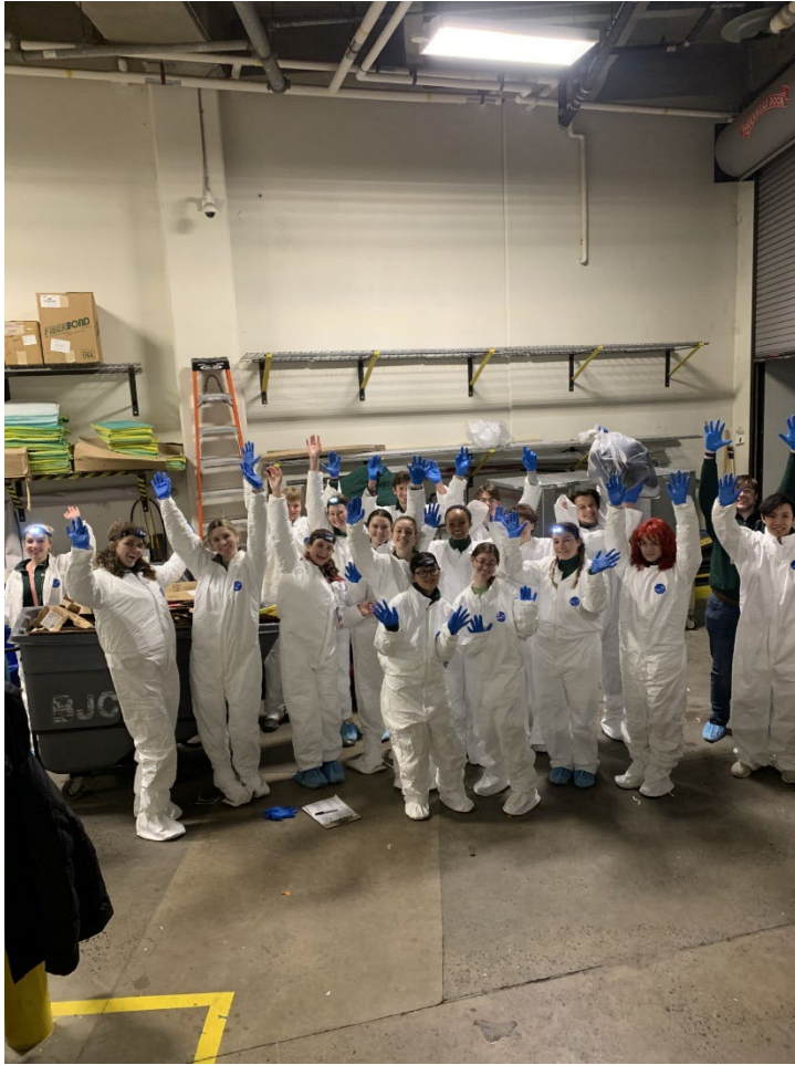
Caption: Group photo of the waste-sortation EcoRep group.