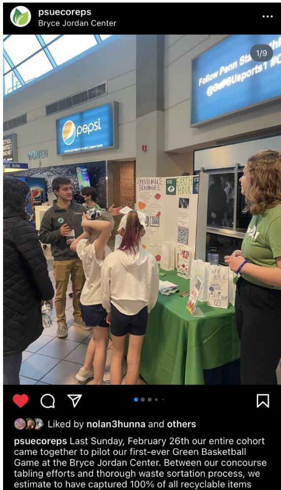
Caption: Instagram post by @psuecoreps to highlight volunteer efforts at the BJC.