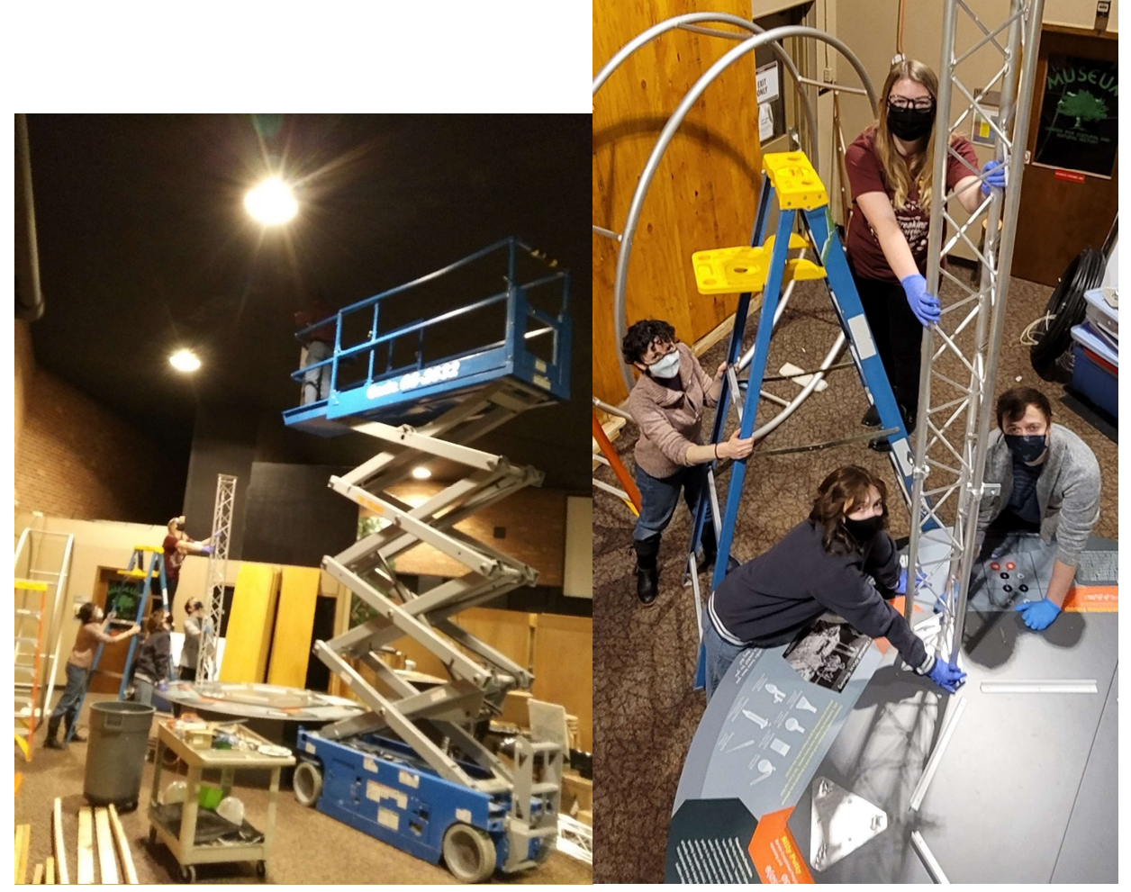
A scissor lift and other equipment loaned by CMU Facilities made it possible to reconstruct the exhibit using 99% of its original components.

freestanding cases in the middle of the space, 90% of the cladding on the walls, and the exhibit itself were all reused items.