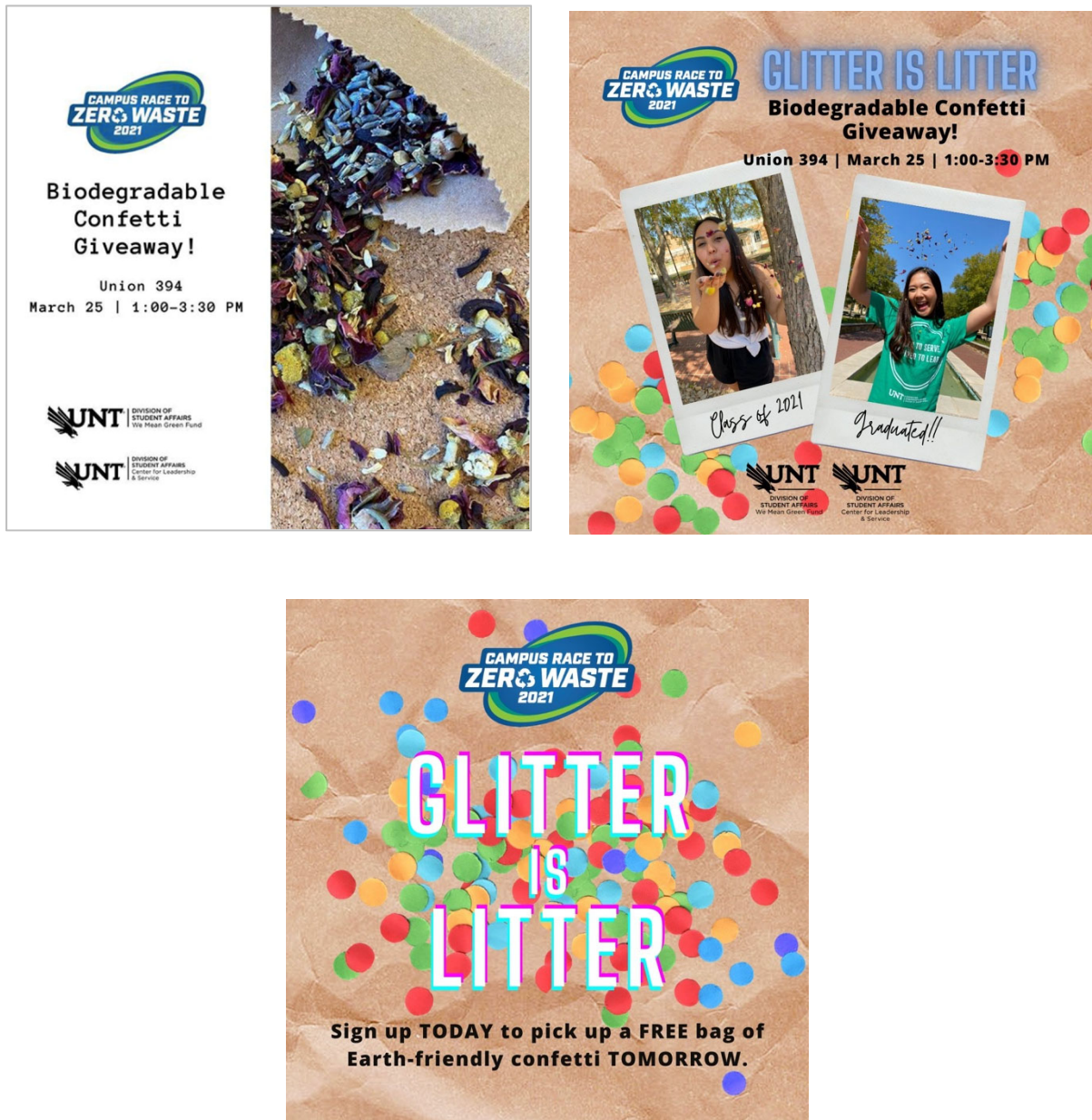
Graphics used to market the Biodegradable Confetti Giveaway event on social media.