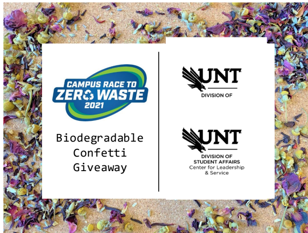
Front side of educational card attached to bags of confetti.

In light of Campus Race to Zero Waste, we invite you to adopt waste-reducing habits and lead by example by choosing eco-friendly confetti for moments of celebration!