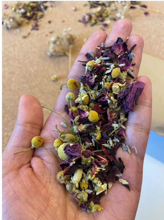
Photos of biodegradable confetti students can expect to receive.