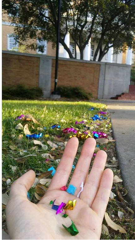
Plastic confetti litter is found on campus grounds, especially near notable campus landmarks that serve as popular graduation photo spots.