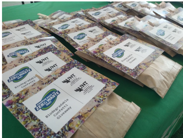
Table set up on the day of the Biodegradable Confetti Giveaway Event