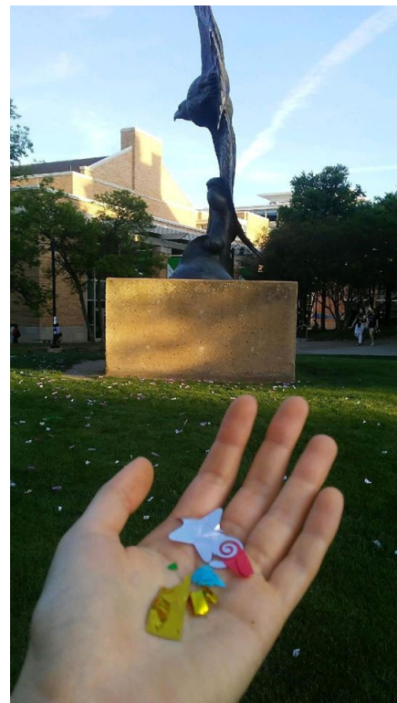
Social media graphic to raise awareness about plastic confetti used in graduation photo shoots creating harmful litter on campus.