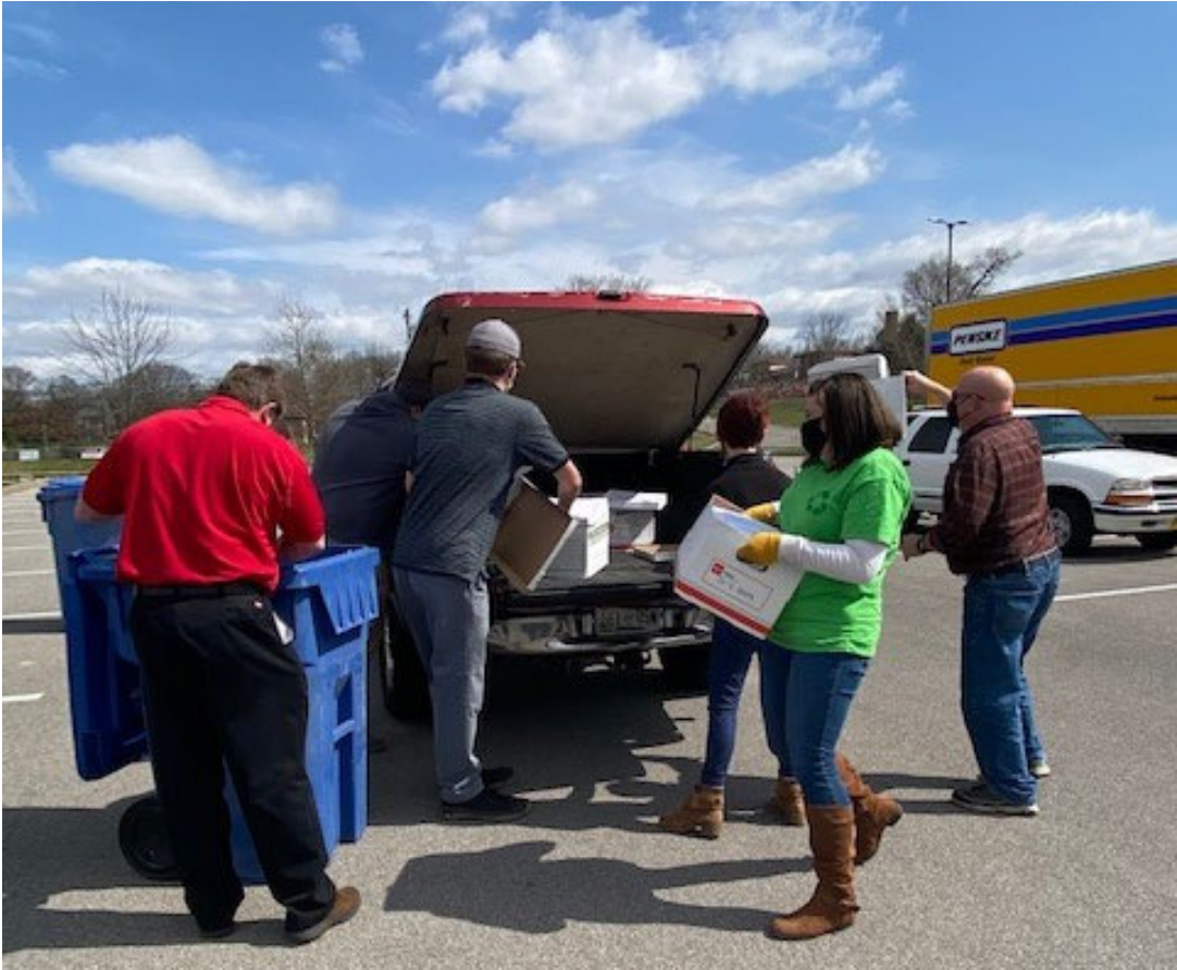
Volunteers unloading boxes of paper from a citizen's vehicle for shredding.