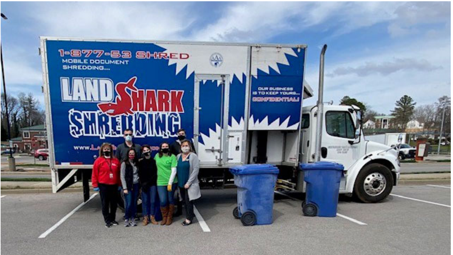
Volunteers standing with the shred truck March 19 th after the recycling event.