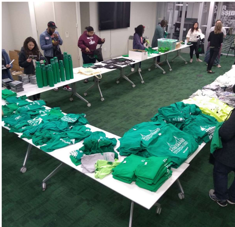
Images 9-13: UNT Students, staff and faculty rehome gently used donated UNT swag items at the UNT Merch Swap.