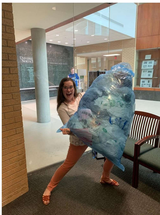
Image 2. The UNT Chemistry Department gets competitive during the Plastic Bag Recycling Competition.