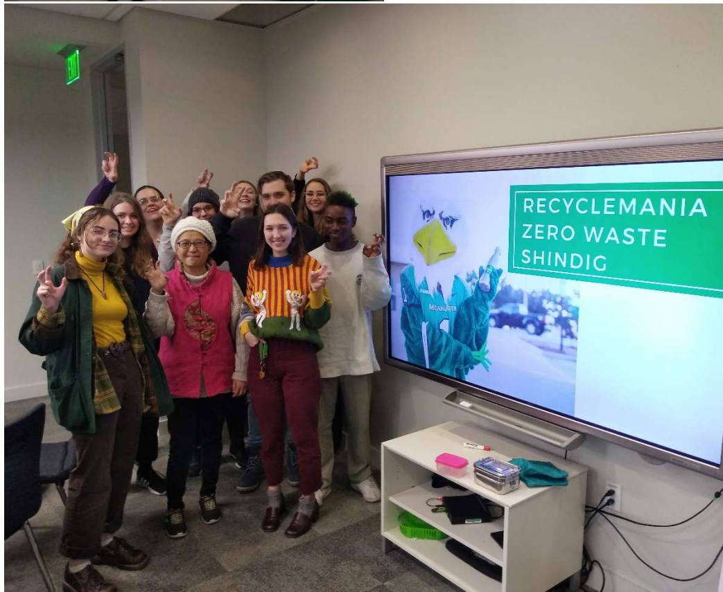
Image 4. Zero Waste Lunch Shindig students, staff, and faculty attend in person event.