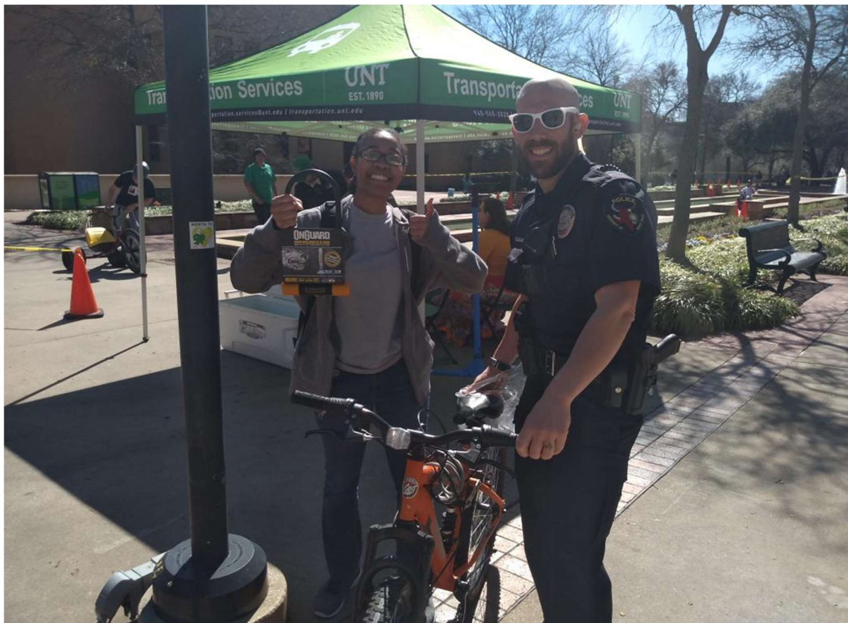
Images 14 & 15: Student receives a secure bike lock from the UNT Police Department at the RecycleMania Bike Repair Fair.