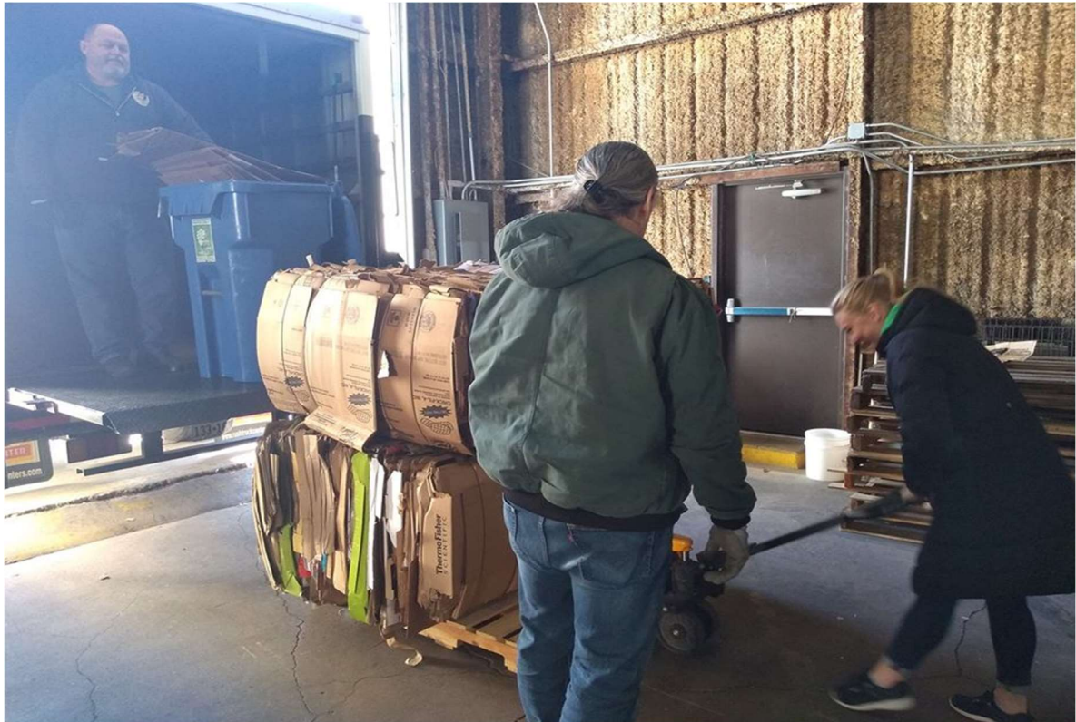
Images 7 & 8. UNT students, staff and faculty attending the UNT recycling facility tour.