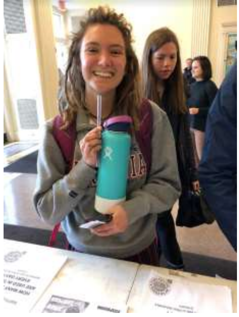
UVA student with her new glass straw!!