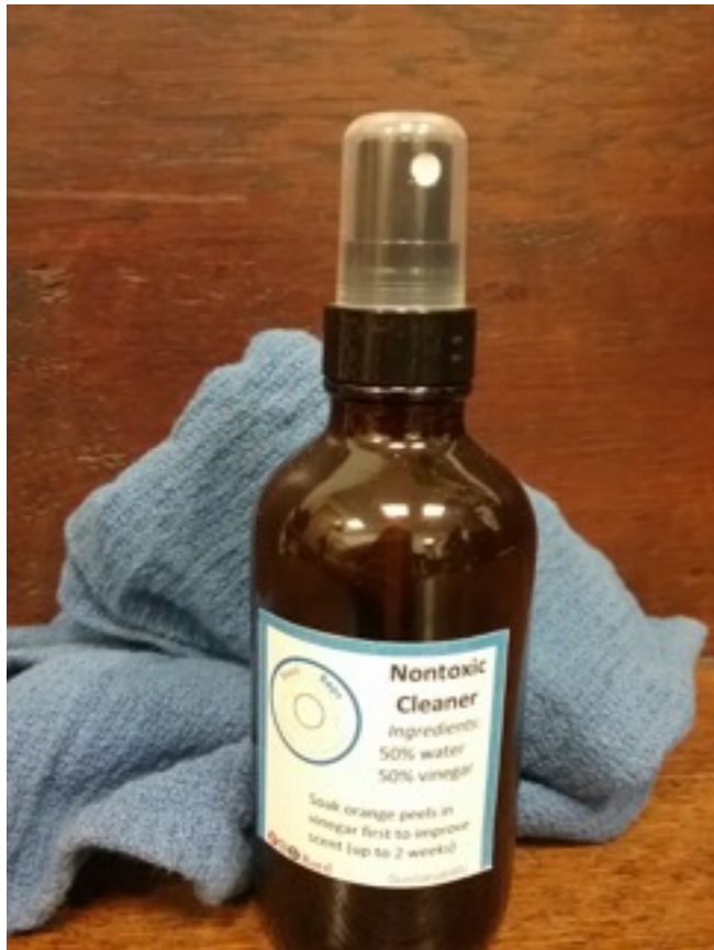
Our Nontoxic cleaner with recipe and our reusable cleaning supplies.