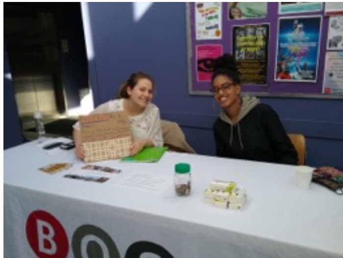
Two of our employees sharing information about sustainable activism