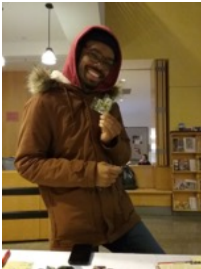
Our Recycled Valentine Day

Please include photos and other visuals below, examples could include social media posts, posters or other graphics related to the project. Include captions where necessary.