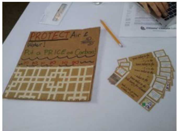
Cardboard climate activism tiles for a rally in Albany