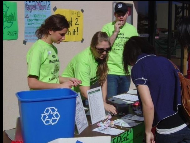
I ♥ recycling