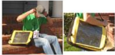
Juice Bag ES300 Messenger all bags...