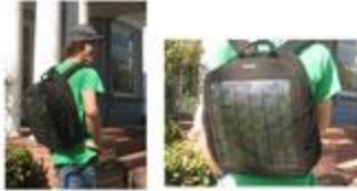
Juice Bag ES100 Backpack