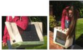
Juice Bag Solar Beach Tote