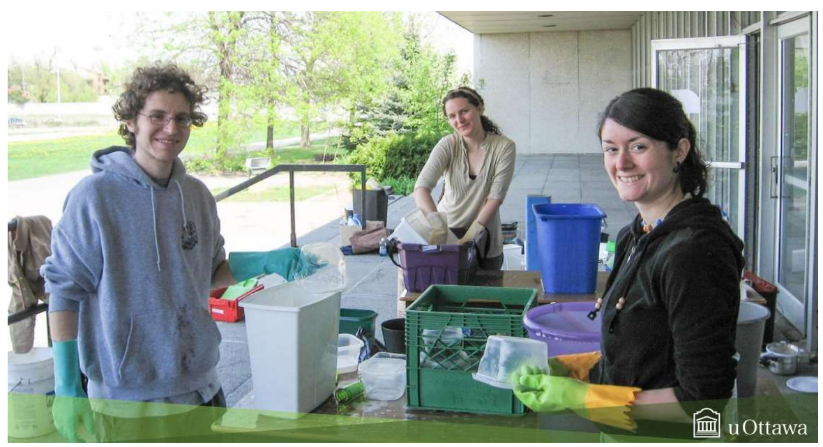
Our lovely volunteers sorting through donated items.