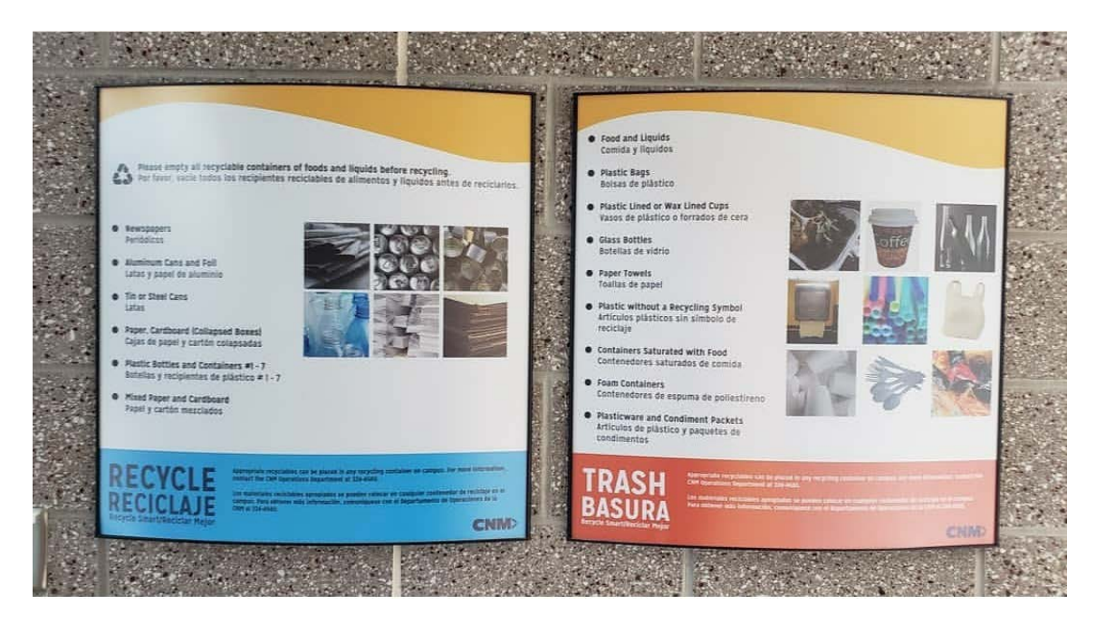
EDUCATIONAL SIGANGE-CAMPAIGN COMPONENT