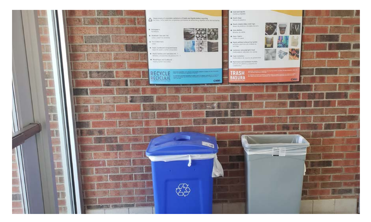
PAIRED BINS UNDER NEW RECYCLING SIGNAGE

<sup>1</sup> The signage project is meant to encourage recycling best practices, but also to create a situation in which all bins in common areas are "paired." Studies show, including data collected during RecycleMania in 2019 at CNM, that the pairing of bins both reduces contamination of recyclables as well as burden on custodial staff (vs. many locations of unpaired bins). Bins were paired as a part of RecycleMania 2019 campaign, but without anything to fix them to a location, they continued to move about.