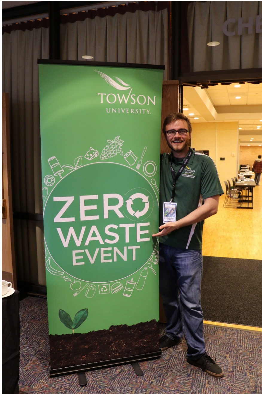
Zero Waste Event Banner

Please email completed template form and supplemental documents (photos, newspaper articles, website links, etc. to helpline@recyclemaniacs.org with "RecycleMania Case Study submission-Campus Engagement – Awareness Campaign" in the subject line. Case study submissions are due no later than Friday, May 11, 2018.