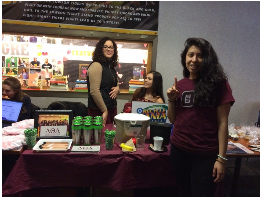
Lambda Theta Alpha tabling event