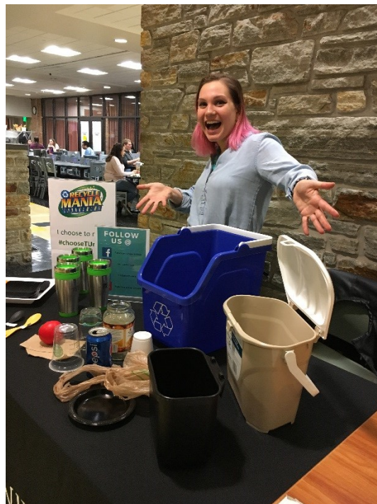
The Office of Sustainability tabling for Recyclemania