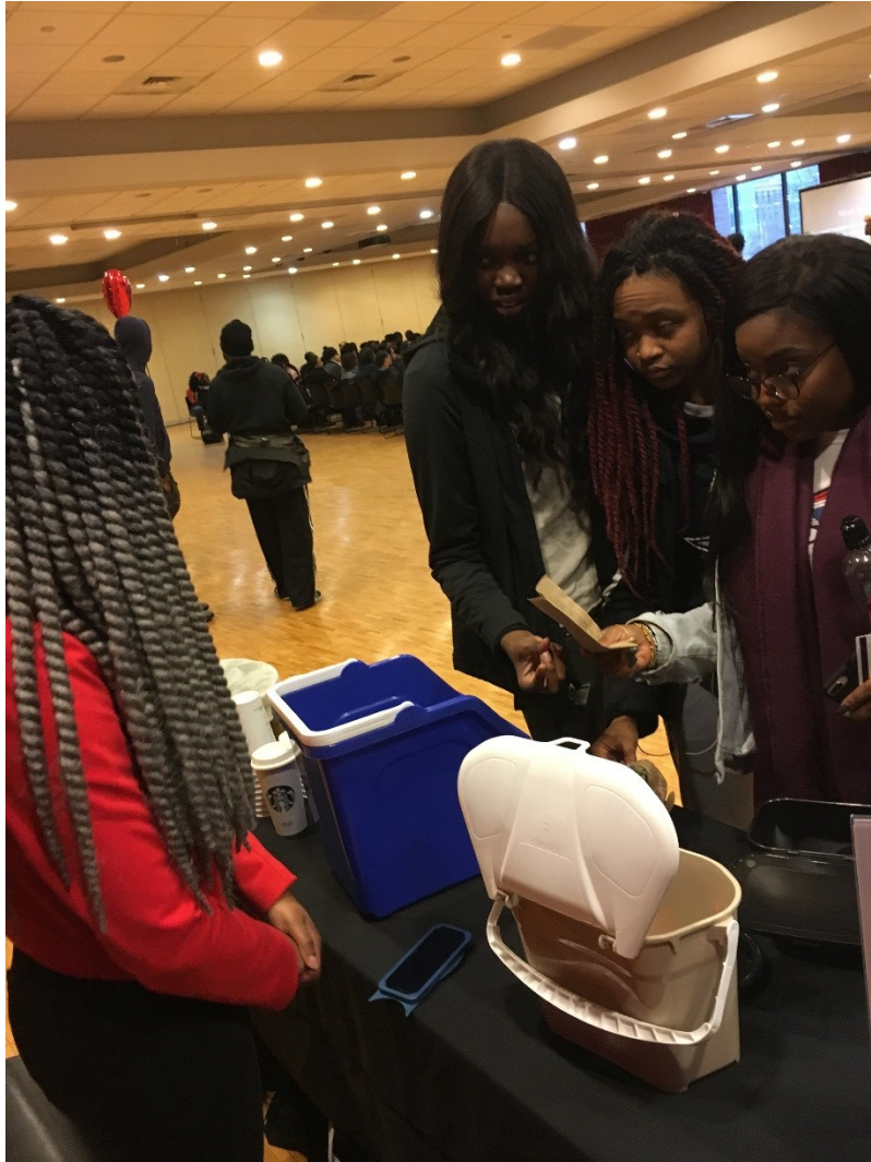
Students play “The Waste Sorting Game” at The Black Student Union’s Zero Waste Valentine’s Day Event