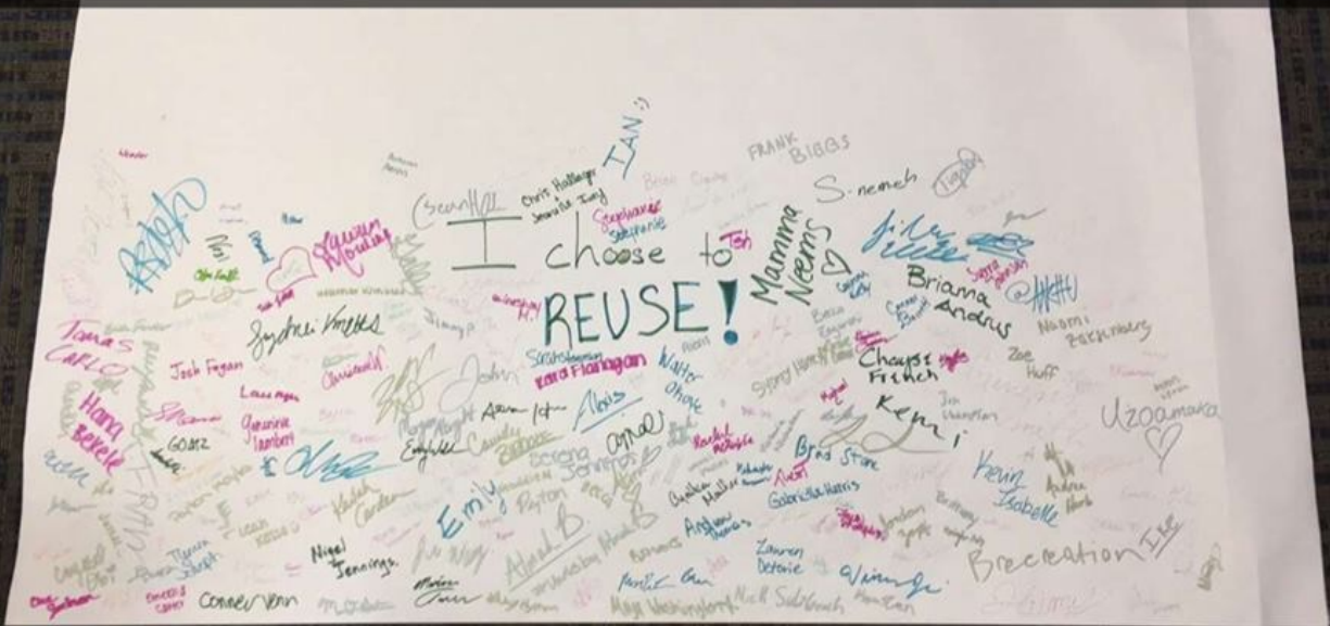
One of the "I choose TU reuse" pledge sheets

Thank you to the 197 people who stopped to sign!