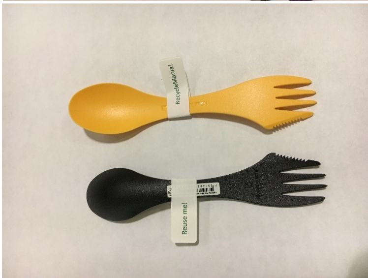
Reusable sporks giveaway