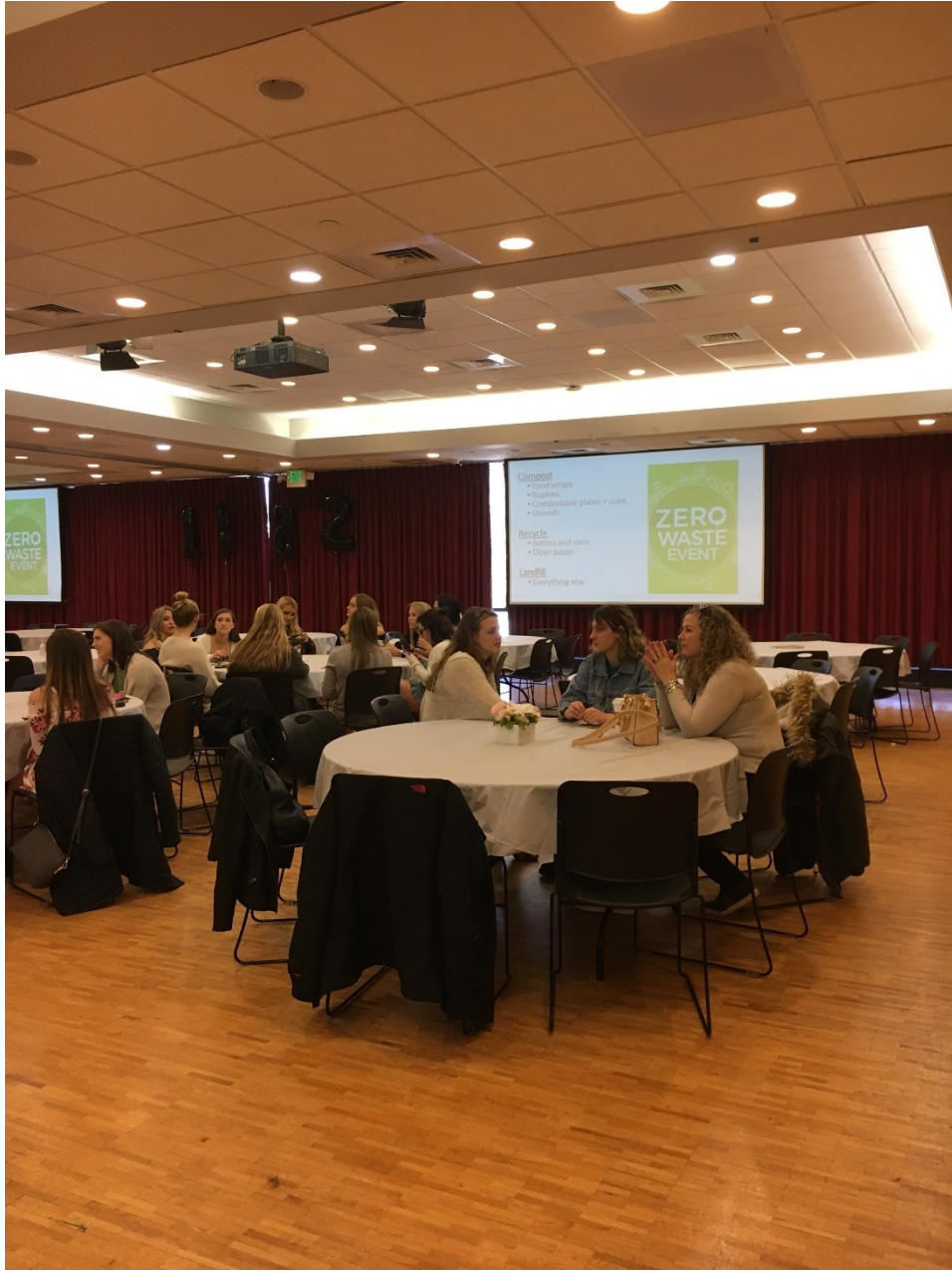
Zero Waste Phi Mu Alumni Brunch