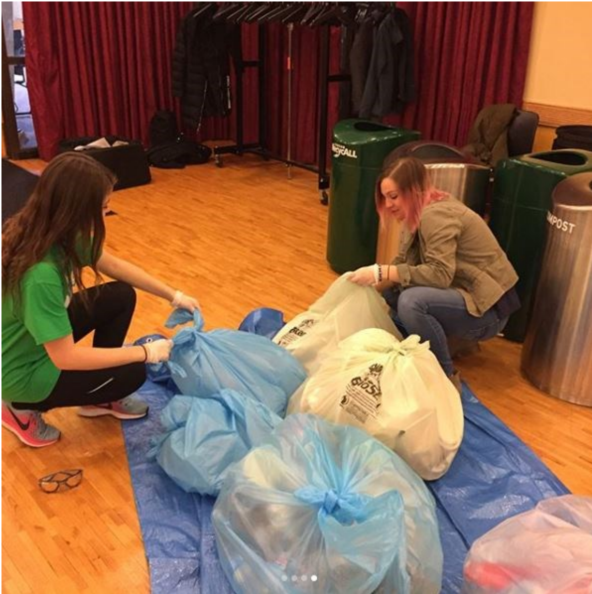
Volunteers sort waste after the Phi Mu Zero Waste Brunch.