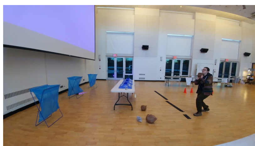
Basketball Plastic Bag Ball game, where participants had to throw a ball of plastic bags into a recycling bin.